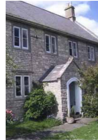
B) New slim-profile double-glazed units in Grade II listed building (Tunley Farmhouse, Tunley Hill, Camerton; view application)