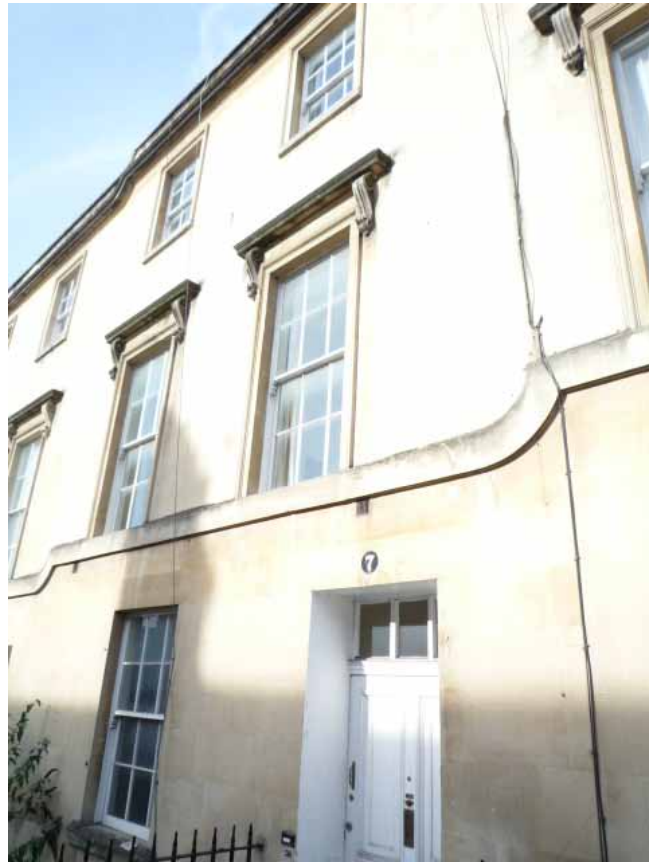
E) Refurbishment and extension of a Grade II listed building incorporating energy conservation measures (7 Charlotte Street; view application)