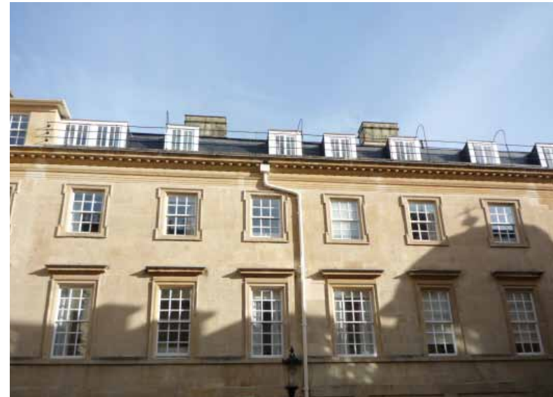
A) New slim-profile double-glazed windows in Grade I listed building (St John's Hospital, Bath City Centre; view application)

The following case studies provide examples of detailed applications for Listed Building Consent, demonstrating good practice both in the level of detail provided and in the initial consideration of measures. You will see that not all of the proposed measures were well received; however these also provide useful case studies for potential applicants. Please note that all planning and listed building applications are available for public viewing online .